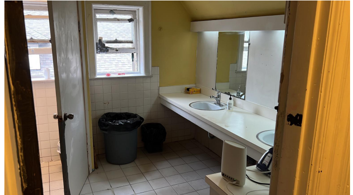
Before & After: 3rd Floor Washroom